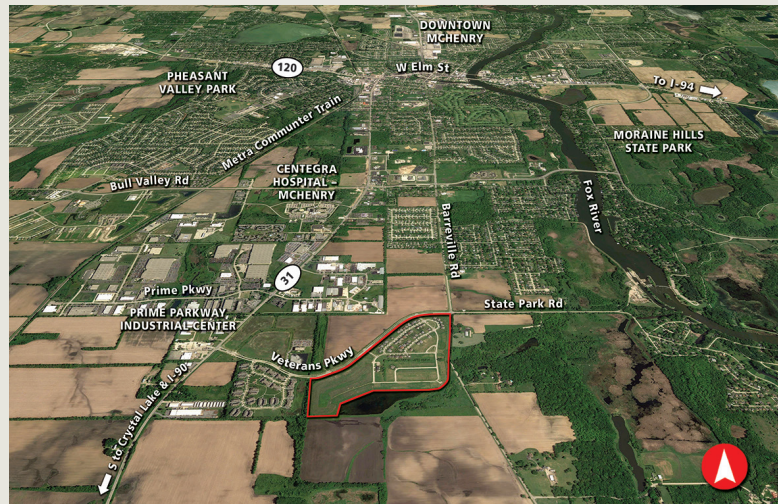
McHenry Oaks, Chicago, IL

This spring, Avanti acquired a partially completed 40-acre residential community in the suburban City of McHenry, 30 miles north of Chicago. The community, known as the Oaks at Irish Prairie, or McHenry Oaks, is a collection of 152 platted single-family lots, the majority of which are substantially developed. Residents of McHenry Oaks enjoy affordable, easy access to the town centers of both McHenry and nearby Crystal Lake. Moreover, the site offers convenience not only to Chicago commuters via rail, but also to suburban commuters who drive to employment centers to the north and northwest of the city.