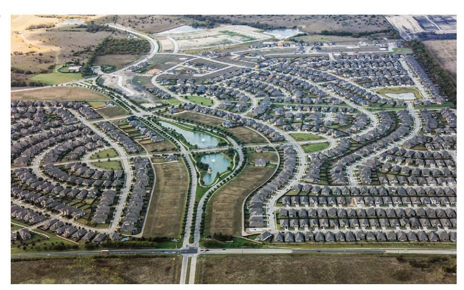
Devonshire, an Avanti community under active development in the Dallas, TX area.

In our own portfolio, we're witnessing this growth every day, with acute supply shortages in the growing suburban Sunbelt corridors of our target markets. In Avanti's communities, from Phoenix to Florida, we are selling at our highest rates in years. We've even