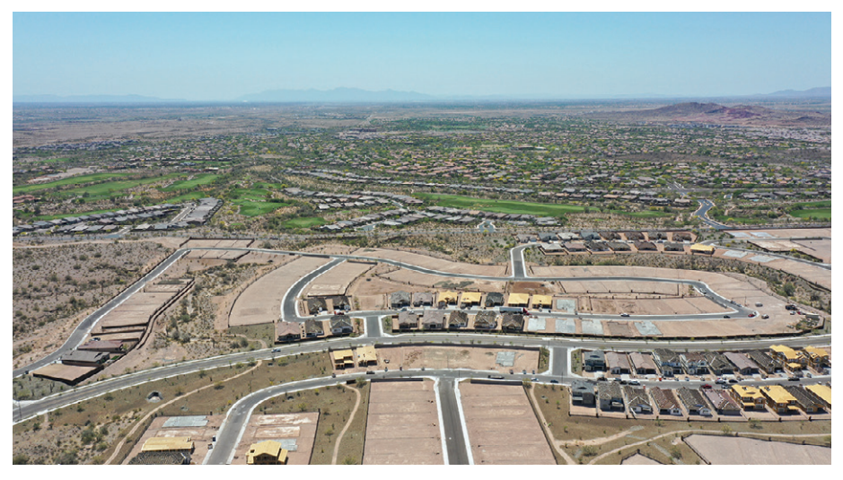
Lake Pleasant, an Avanti community under active development in the Phoenix, AZ area.

As importantly, when we invest with disciplined underwriting based on